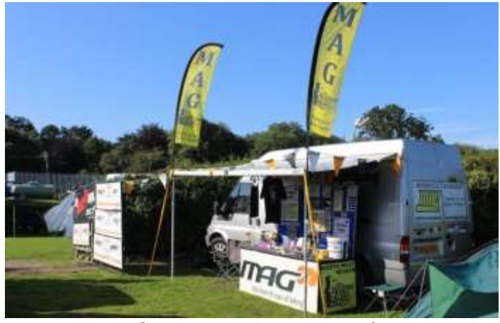
Bloody MAG - you can't get away from them!