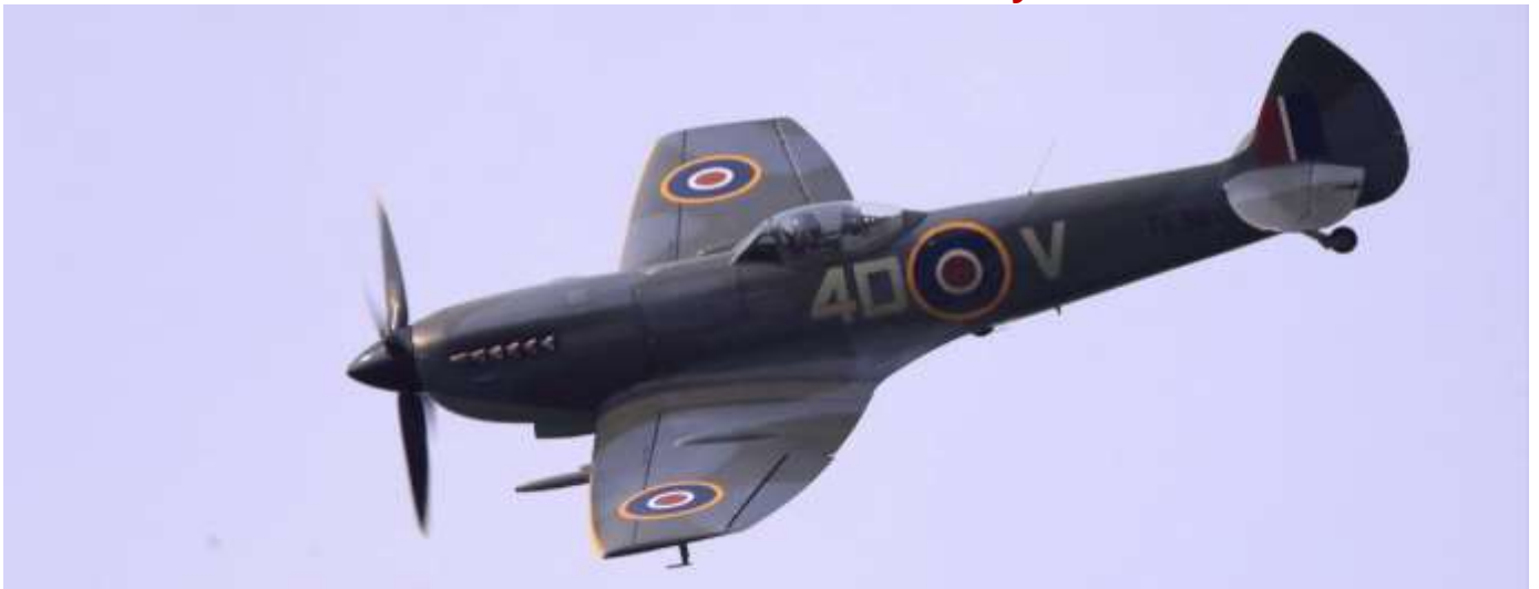
The Spitfire fly past was stunning

The 25 th anniversary You've Been Nabbed rally was an absolute belter, helped in large part by the brilliant weather. That and the great bands and comedians of course. Everyone was slightly disappointed when the planned fly past by a WW2 DC3 Dakota was cancelled due to engine failure – but then they sent a Spitfire instead! It was a magical moment that put the icing on the cake of a great rally.