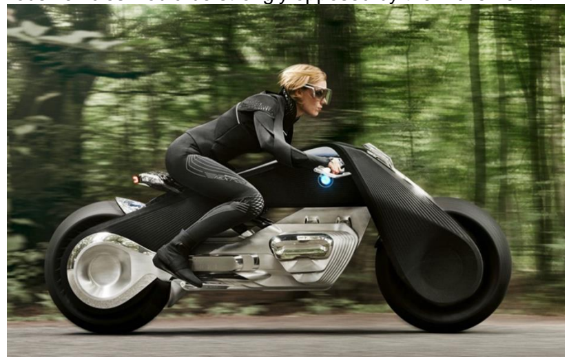
BMW also seem to predict that crash helmets will be optional in the future – typical German devil-may-care attitude, eh?

We want to work with the Government to make sure autonomous vehicles don't add further problems to the road network. Calm discussion and the setting or parameters which properly define the relationship between autonomous vehicles and the rest of the traffic community are what's called for here. These are the points we've made in our submission to the committee, and we hope we will be called as witnesses to their inquiry when the time comes.'