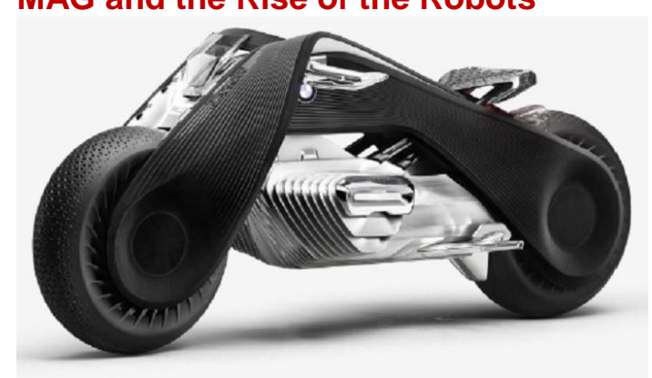
BMW's "Next 100" self-balancing concept bike – not sure where you'd fit your top-box?

The future marches on, as it is wont to do, and every new day brings us closer to the world of autonomous vehicles. Despite what deniers may say, even within MAG, there seems to be an historic inevitability about the expansion of robotics into all areas of life. Over five million jobs will be lost in the 15 leading economies by 2020 as a result of developments in genetics, artificial intelligence, robotics and other technological change, according to the World Economic Forum. Foxconn, who supply Apple with components, shed 60,000 jobs in China this year alone as robots took over. Of course, it's been happening for years but now it's gathering momentum and no part of the workplace is immune.