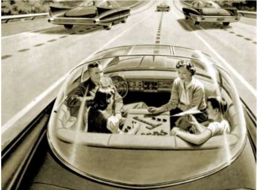
Ideas about driverless vehicles have been around since the 1950s

Meanwhile, the House of Lords science and technology committee has suggested that new driving tests should be introduced for drivers of such vehicles, even for those who also hold a licence.