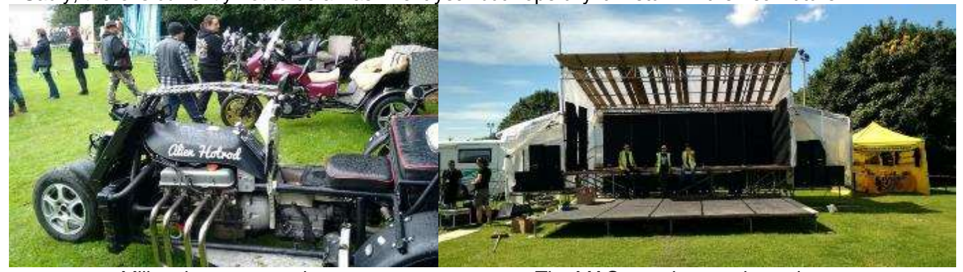
Millennium custom show

Long-time MAG supporting club Millennium 2000 BC kindly invited us along to their latest Caveman Bash rally at Salmesbury. It was a real pleasure to be there as they always put on a good party. Sadly, there is currently not to be a Bash next year but hopefully it'll return in the near future.