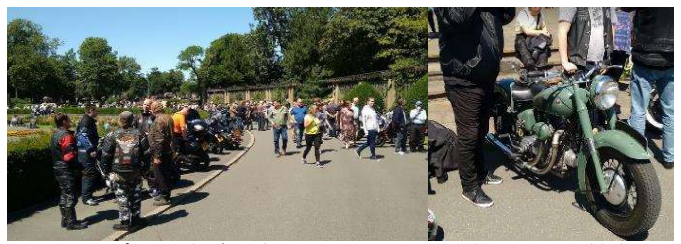
Great weather, fantastic turnout