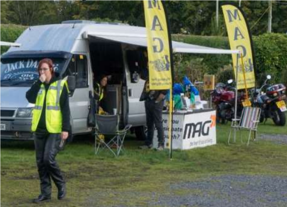
Welcome to Whittingham