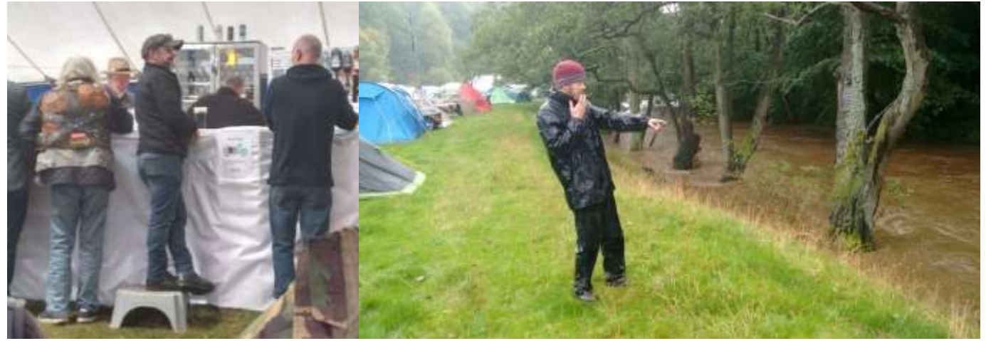
The real ale bar catered for bikers of all sizes – thoughtful, that is!