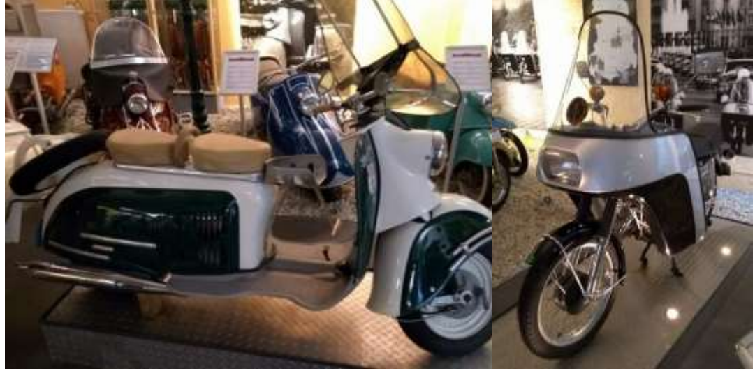
They built some very sturdy looking scooters.

If you're over that way, and have a liking for old East German bikes, the DDR Motorrad Museum in Berlin is well worth a visit. Just a stone's throw from Alexanderplatz, under the railway arches, some of the Communist Bloc's finest are lovingly curated and your's to see for just six and a half euros. They may not have been as innovative as the Japs but they were solidly built and had a quirky style all of their own. The East German government decided in the early 1960s that all motorcycles produced should be two-strokes as they were cheaper to produce, simple to maintain and powerful for their cc. And also, as a bonus, very smoky. One thing's for certain – the EU will never allow their like again.