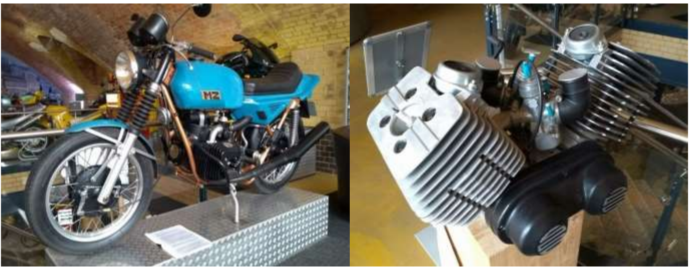
Horizontally opposed two-stroke twin Guzzi inspired two-stroke?