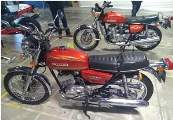
Two of the prettiest bikes of the '70s – a GT250A in the foreground (when they'd lost that Ram Air nonsense) with a matching 750 Kettle behind.