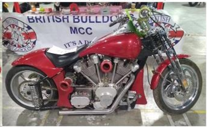
British Bulldogs MCC brought the one-off, 4.5 litre Melling Titan V-twin. As they said, "your Rocket 3 is nice – small but nice!"