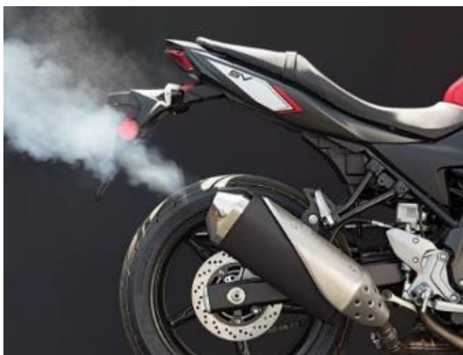
Not seen much nowadays

Despite MAG explaining that powered two-wheelers (PTW's) are part of the solution to pollution and congestion problems, a recent newspaper article says bikes are to blame!