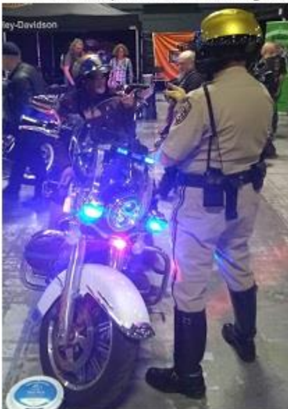
CHiPs with everything.