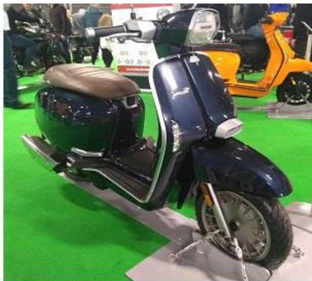
Lambrettas, new and old.