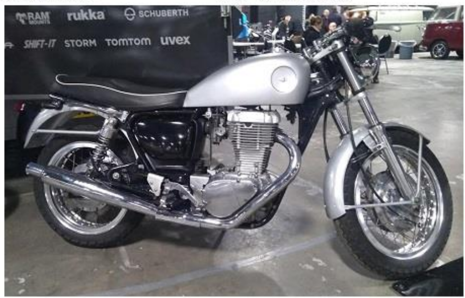
What do you do if you really want a BSA Gold Star but all you've got is a Suzuki LS650 Savage? It's work in progress but looking mighty good.