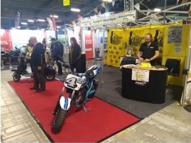
As always, MAG gives every member the red carpet treatment!

The general feedback was that the Manchester Bike Show at Event City was better than last year. The MAG stand was there both days and there was a constant stream of members, new and old, calling in to say Hi. As ever, we're always chuffed with the level of encouragement we get. Here are some interesting machines at the show: