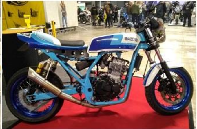
Grobo from Blackpool MAG's latest creation shows that you can make a thing of beauty from the ugliest donor bike (Sachs 650 Roadster)