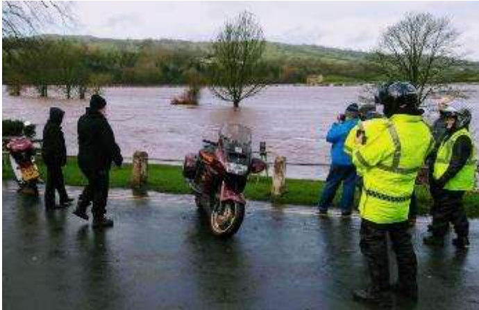
This used to be the River Ribble