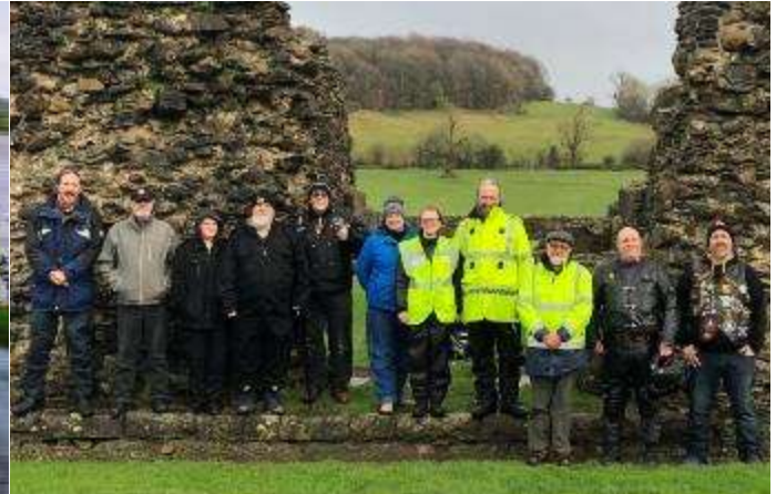
End of the road - Sawley Abbey

It wasn't the best-timed event we've ever held but we didn't let it beat us. This year we were joined by Storm Ciara, who made it a bit difficult for many to even reach us. We rode into the teeth of a gale and much of our route was flooded out. Luckily it didn't reach above the sparkplugs. As you can imagine, it was a hoot. The fact that Yorkshire decided to cancel their run only made it sweeter. A big thanks to all who made the run (or tried their best but got driven back).