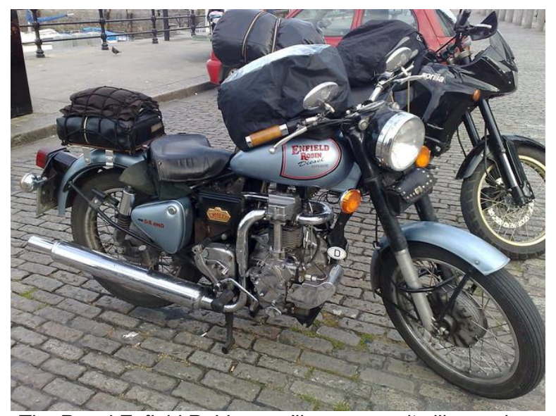
The Royal Enfield Robin - we'll never see its like again

Sales of "green" vehicles have jumped above diesels for the first time, indicating that fossil-fuelled vehicles are on the way out. 33,000 pure electric and hybrid cars were registered between April and June, compared with 29,900 diesels. Four years ago, diesels outsold hybrid and electric cars by almost 14 to 1. This shift away from diesel has been hastened by the introduction of charges such as the ultra-low emission zone in central London, which charges owners of diesel vehicles. Diesel may have a future as a fuel for HGVs but its future use by cars in cities is limited.